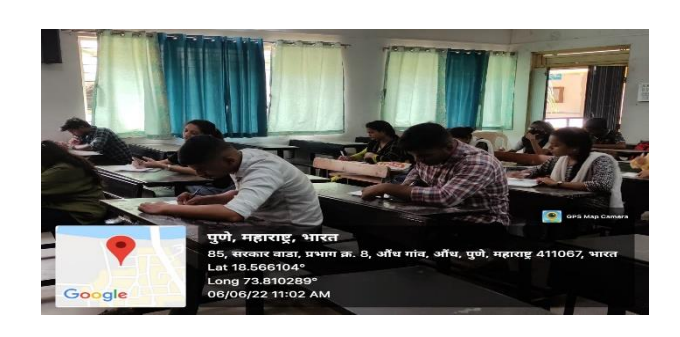
Essay Competition Occasion of Shivswarajya Din 06/06/2022